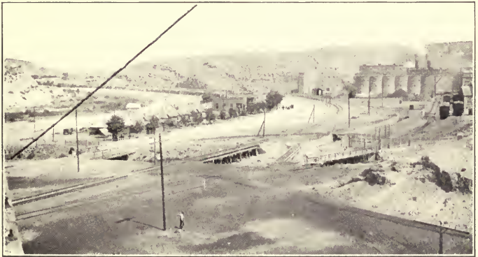
CAMP AND CEMENT PLANT